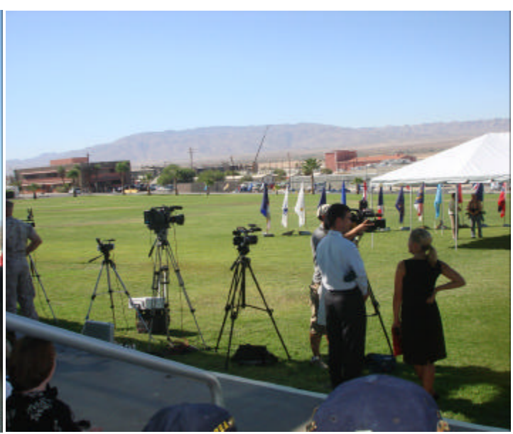
The Media was there