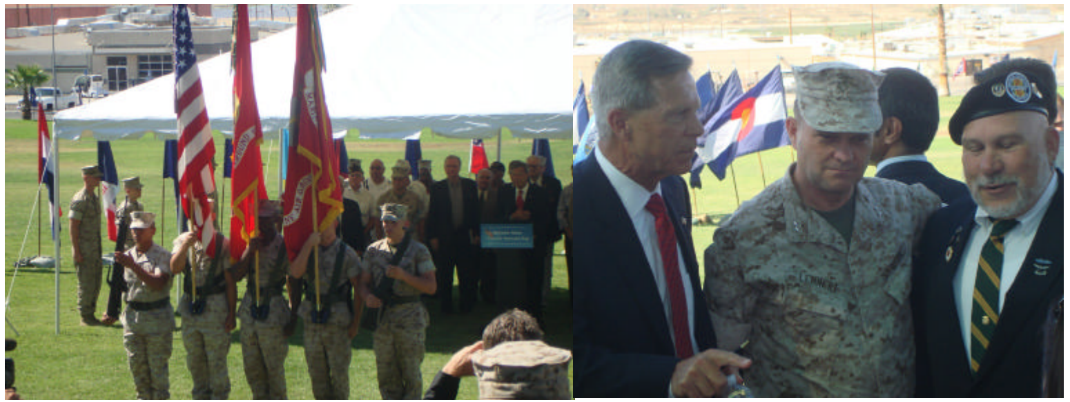
Present Colors (all stand please)